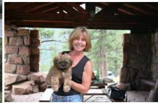
Visitors at Dedisse Shelter

Denver residents absolutely want neighborhood parks, trails, and recreation facilities. They want mountain parks, too. In fact, mountain parks are used and valued more than many other park and recreation facilities. Even in difficult budget times, the answer does not lie in pitting Mountain Parks against city parks. Recreation,