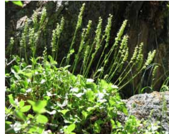
Wildflowers at Pence Mountain Park

Source: 2003 Game Plan General Survey of Denver Residents