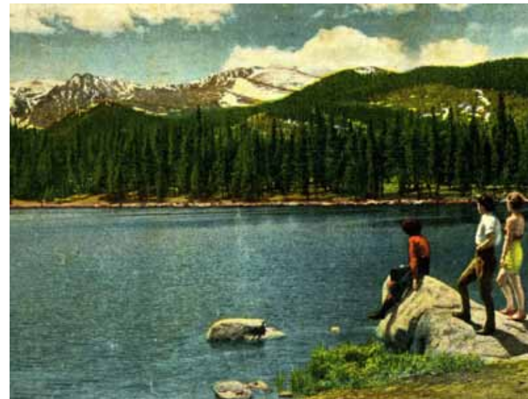
Echo Lake Park