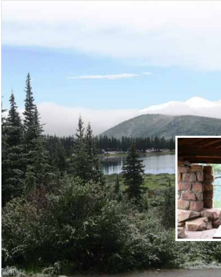
Echo Lake Park

What is needed to take this world-renowned system of parks to a higher level of quality and ensure that all Denver residents get to experience their Mountain Parks?