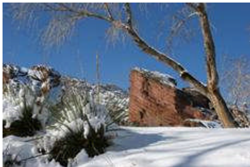
Red Rocks Park, DMP